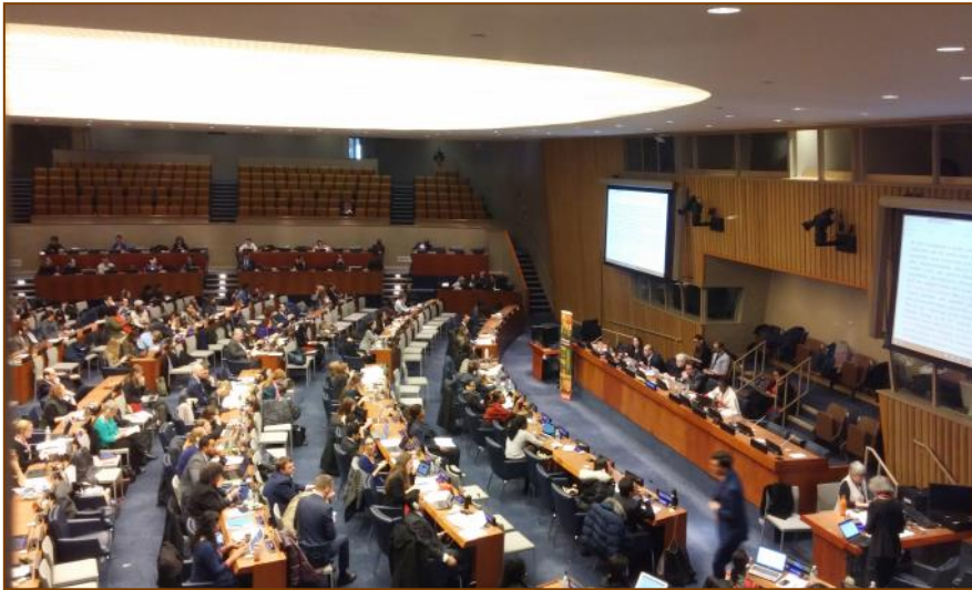
UN Member nations deliberations

sitting on the footpath with an appeal written on cardboard rather than standing and speaking to the passers-by. When the snow fell hard and the cold really bit, the notices on the cardboard changed, and one man had written “Shelters are unsafe!” on his cardboard. I guessed that people had tried to help him get indoors, but he seemed to prefer the streets. Alongside the street people were staggering quantities of rubbish bags. The first morning I took my walk to the UN from my hotel, I assumed it was a weekly rubbish collection, but it became apparent that rubbish is collected daily, in unimaginably vast quantities.