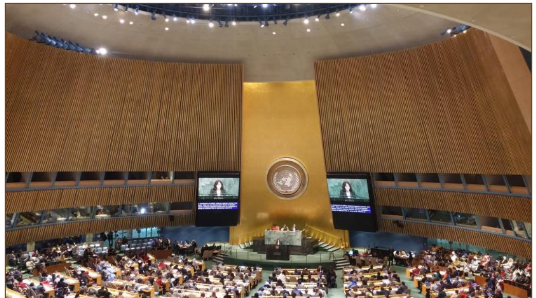
Opening Ceremony of UNCSW62

Nevertheless, I boarded my United Airlines