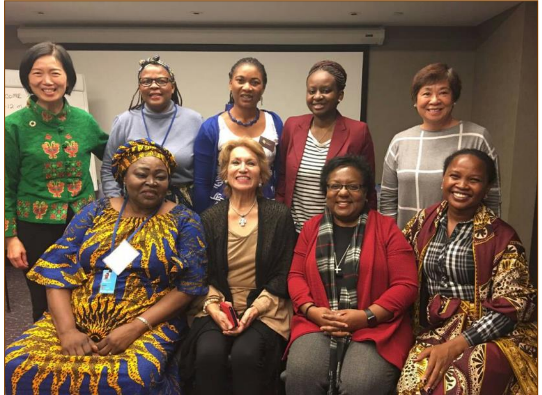
Some of our lovely Anglican delegates at UNCSW62

I attended several presentations and panel discussions concerned with gender in the media. Female journalists from some countries struggle to be taken seriously by editors, and